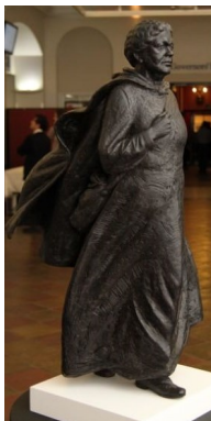
Quarter scale maquette of Mary Seacole