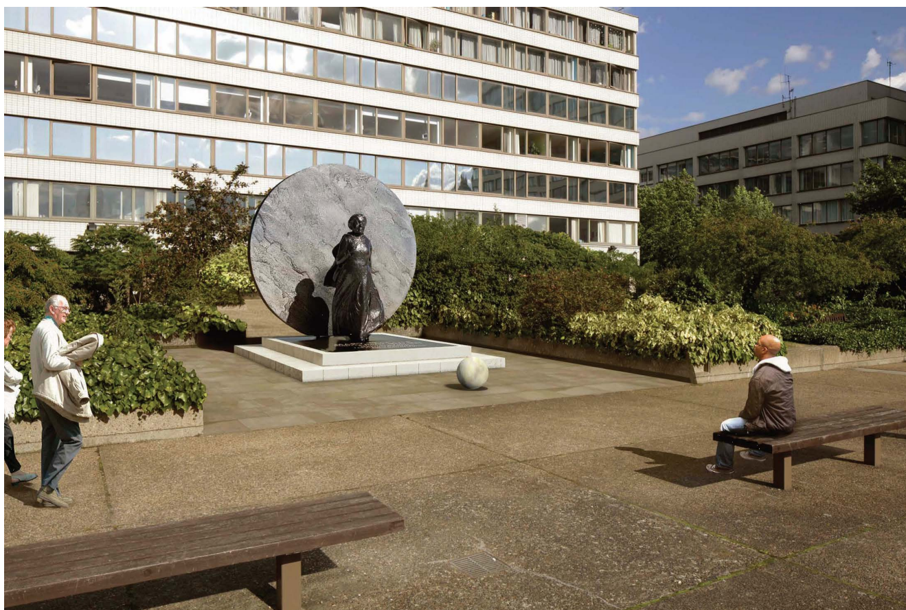
Computer generated image of the memorial design concept as it may look once installed on site Miller Hare