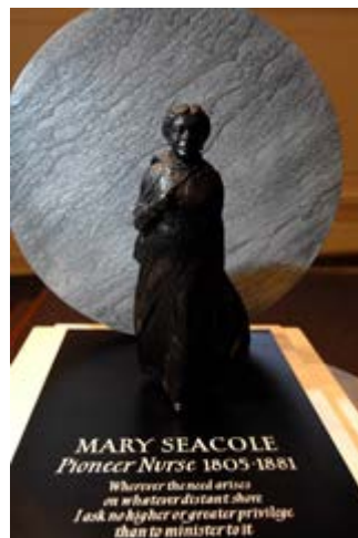
10th Scale maquette of Mary Seacole with disc

On Tuesday 29 October 2013 the quarter scale model of the historic statue in memory of pioneering battlefield nurse Mary Seacole was presented at St Thomas' Hospital, where the full sized sculpture will eventually stand. The maquette revealed the design of the Mary Seacole Memorial Statue, a permanent, ten-foot high bronze statue of Mary Seacole which will be located in the gardens of St Thomas' Hospital, facing the Houses of Parliament.