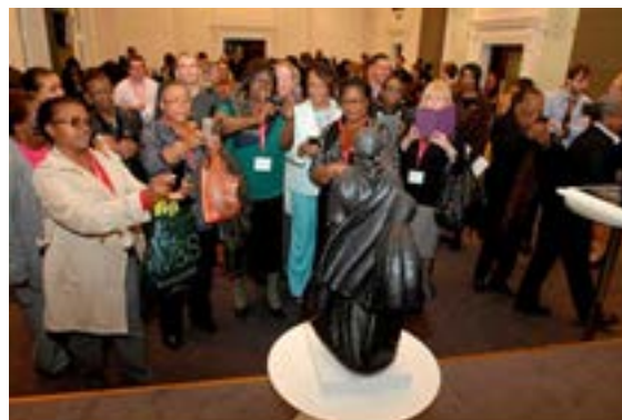
Members of the audience as the maquette is unveiled