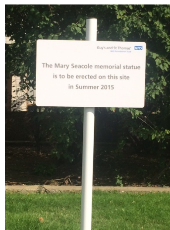
The dedication plaque in place at the memorial site